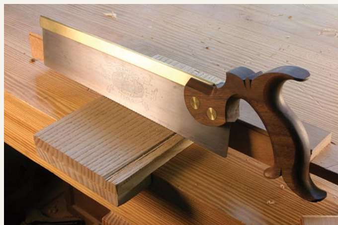
TOOLS FOR WORKING WOOD ■ 800-426-4613 ■ toolsforworkingwood.com

to come). The Gramercy is definitely not an also-ran. Its distinct set of features have launched it into the very top tier of makers and it deserves your careful consideration.