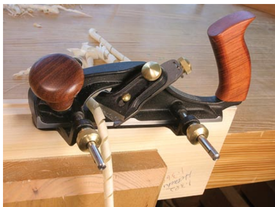
LEE VALLEY TOOLS ■ 800-267-8735 ■ leevalley.com

Need more proof? Then check out our full review of this tool in the Tool Test column of this issue on page 36.