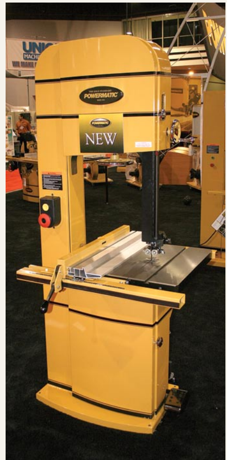
POWERMATIC ■ 800-274-6848 ■ powermatic.com

Priced at about $4,000, it's at the upper end of the market, but it will be the last band saw you ever buy.