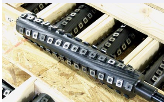
BYRD TOOL ■ 800-441-2973 ■ byrdtool.com

Until now, these cutterheads were available only for bigger machines. Now Byrd Tool has begun making aftermarket Shelix heads for some portable planers, including the DeWalt 13" DW735. And others are in the works, including Ridgid and Delta planers. At about $410 for a Shelix replacement head, it might be better to update your existing planer than replace it. PW